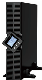
Display panel can be rotated